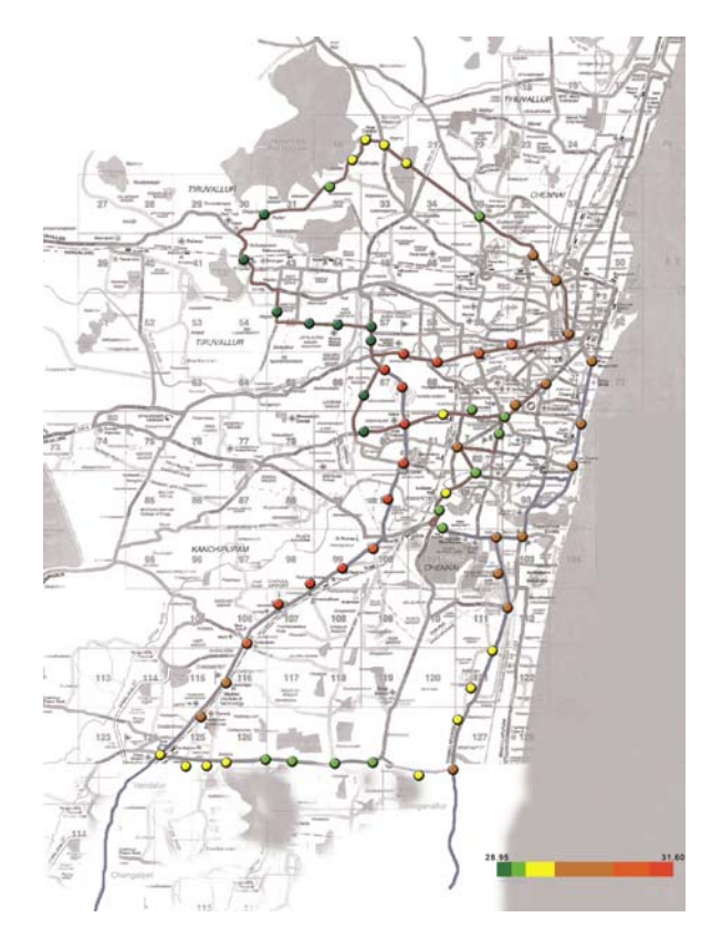
Fig. 3. Temperature distribution mapping based on the mobile survey.

The data collected through the mobile survey conducted in two fixed return routes were plotted to show the temperature mapping of Chennai city (Fig. 3). The results indicated the presence of cool islands in Thirumangalam, Valluvarkottam, Anna University, Gemini