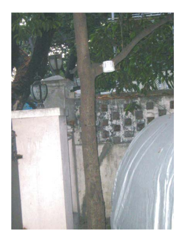
Fig. 1. Typical instrument set up for measurements.

To map a citywide temperature distribution at night when maximum heat island intensity occurs, a mobile survey was conducted. The mobile measurements were collected simultaneously in two fixed return routes covering majority of the locations in the city on 18^{th} May 2008 between 00.20 am to 5.30am, which was accidentally the hottest day of the year.