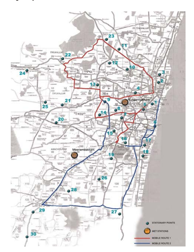
Fig. 2. Mobile routes and Stationary locations.

The stationary locations for measurements were chosen so that the radiating lines from the center cover the city, suburban and rural locations to equip in plotting the UHI profile of Chennai. The two mobile routes were chosen in such a way it covers most of the locations in the city covering urban, suburban and rural areas. The Nungambakkam meteorological station is located within the city and is characterized with commercial establishments dominated with public buildings and has a high density and very high traffic. The Meenambakkam meteorological station is an airport station located in the suburbs of Chennai. 14 urban stations, 9 suburban stations and 7 rural locations were chosen for the study. The growth pattern of the city is by and large along the three major National Highways namely NH4, NH45 and NH5. The rural stations are chosen along these major highways.