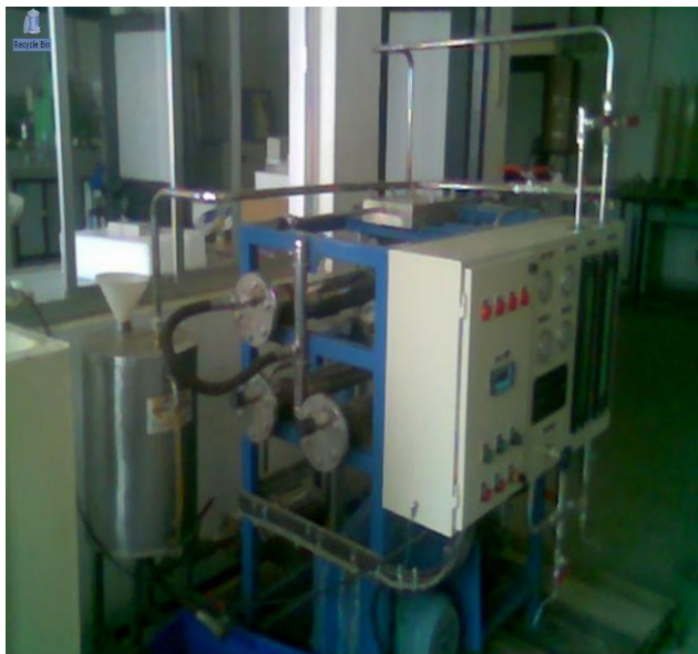
Fig 1. Experimental Set up for Ultra filtration and Nanofiltration Process

feed concentration and flow rate [4]. The pressure-flux behaviour in typical NF processes is pressure dependent at low pressures and pressure independent at high pressures; increasing pressure increases permeate flux when the pressure is low, but permeate flux becomes independent of pressure when the pressure is high [6]. The resistance model describes correctly the observed pressure-flux behaviour of the NF processes. In the resistance model, the increase in pressure increases the flux and compact the boundary layer [5]. The compaction of the boundary layer increases its hydraulic resistance and thus opposes further increases in flux. On the other hand osmotic model does not consider the hydraulic resistance of the boundary layer [5].