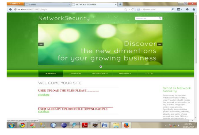
Figure3. File upload